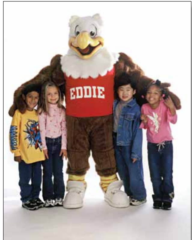
The Eddie Eagle Mascot Costume is a great way to enhance your Eddie Eagle GunSafe Programs and the character makes a big impact on kids.

If you share the feeling that the addition of the Eddie Eagle mascot character will make a big impact on the kids in your area, give us a call at (800) 231-0752 to find out how you can apply for a costume grant – and be on the lookout in 2010 for Eddie Eagle mascot costume contests coming to your state.