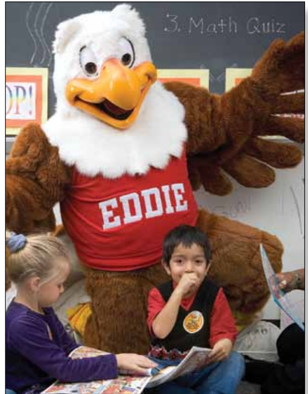
Twenty-six State Governors and twenty-three State Legislatures have endorsed the Eddie Eagle program which has now reached over twenty-three million kids.

As we mark this incredible milestone we must continue to work diligently to spread Eddie Eagle's lifesaving message to even more children. We still have a lot of work ahead. We will not rest until every pre-k through third grade child in America has learned how to stay safe if they encounter a firearm.