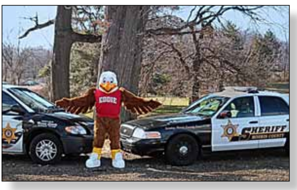
Morris Co. Sheriff's Office shows off their new Eddie Eagle mascot costume.

Office has been using the program for a very long time and received their first Eddie Eagle mascot costume back in 2001. After many years and visits with Morris County youth, their costume was simply getting worn out. When the ANJRPC found this out they quickly volunteered to try and help the sheriff's office obtain a new Eddie Eagle costume. Within a month ANJRPC