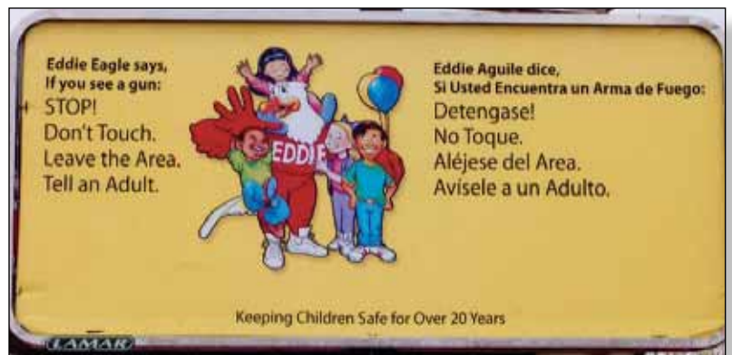
One of 10 billboards seen in and around Albuquerque, NM.

If you are interested in helping us spread Eddie's safety message or in becoming an Eddie Eagle volunteer, please contact the Eddie Eagle staff at (800) 231-0752.