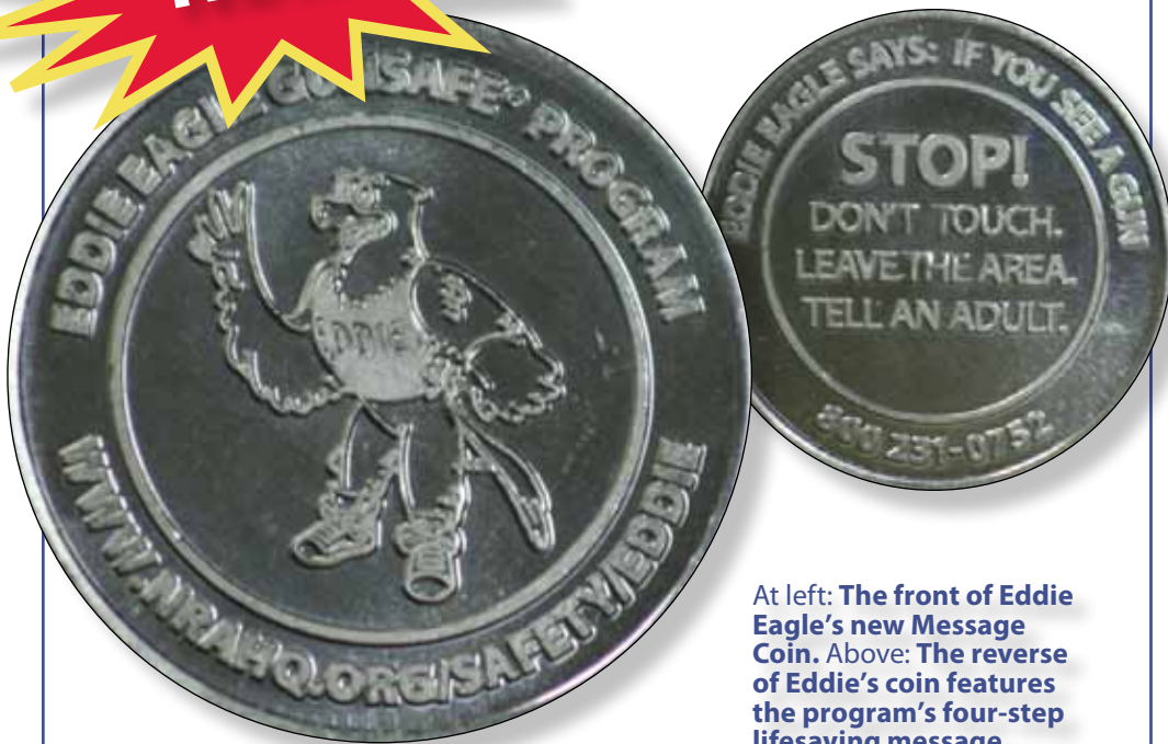
At left: The front of Eddie Eagle's new Message Coin. Above: The reverse of Eddie's coin features the program's four-step lifesaving message.