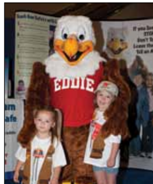
Crowds flock to visit the Eddie Eagle GunSafe Booth at the NRA Annual Meeting In Phoenix, AZ