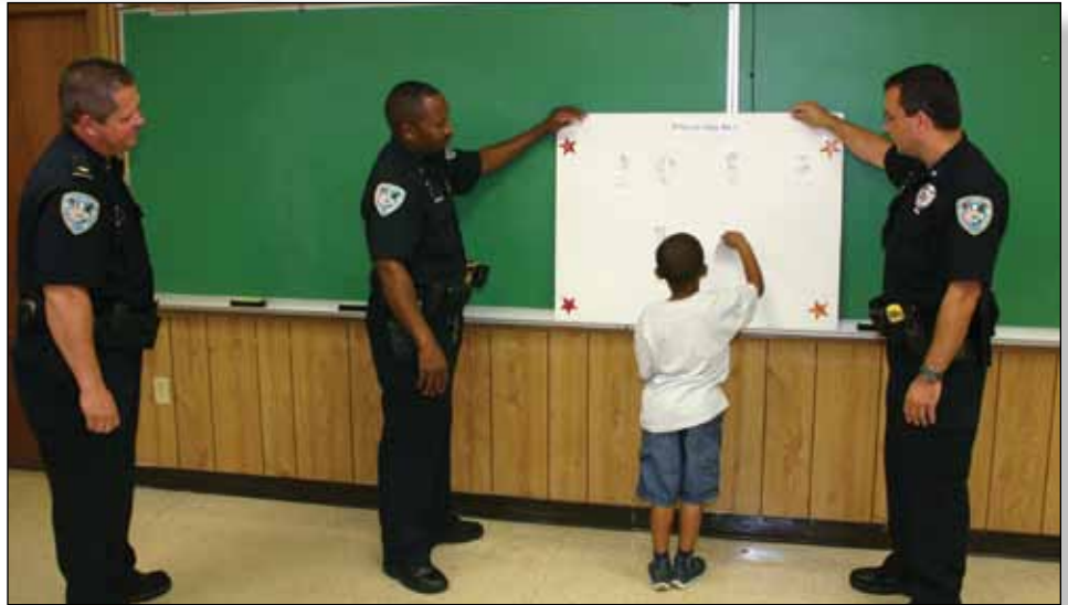
Jefferson County Sheriffs help teach youth about gun safety.

To make the Eddie Eagle program even more interactive, Colonel Pearson and her staff have developed various presentations utilizing homemade panel boards that employ hook-and-loop fasteners and character cut-outs from the Eddie Eagle program materials. For example, one of the boards is entitled "Where Can You Go for Help?", and features cut-outs of children that can be placed on either a safe section of the board (which contains cut-outs of a police