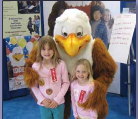
Eddie Eagle poses with fans at the NRA Annual Meetings that were held in Louisville, Kentucky earlier this year.

In addition to the activities at NRA's Annual Meetings and Exhibits, the Eddie Eagle staff also conducted local school assemblies in the days prior to the exhibits. Over a period of three days, the staff worked with the Jefferson County Sheriff's Office to conduct school assemblies and reached over 1,100 Louisville students with Eddie Eagle's important lifesaving message. All of the assemblies were tremendously successful, even receiving coverage on the local ABC nightly news twice.