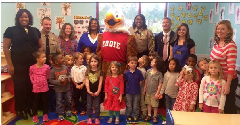
The Pitt County Sheriff's Office also incorporates Eddie Eagle in their yearly summer camp curriculum as well as making sure that Eddie Eagle is available for community functions by request.

programs. Along with new materials, Eddie Eagle mascot costumes have also been redesigned. The Eddie Eagle mascot costumes often make a tremendous impact in their communities; they add an element of excitement to Eddie Eagle presentations and the children are always eager to show Eddie what they have learned about firearms safety. Thanks to Friends of NRA through The NRA Foundation, many law enforcement agencies across the country have been given grant funding to purchase an Eddie Eagle costume of their own. For more information about how to apply for a costume grant, get involved with the Eddie Eagle Program, or have a story you'd like to share about how you used Eddie Eagle to teach children to be GunSafe please email us at eddie@nrahq.org or call us at 1 (800) 231-0752.