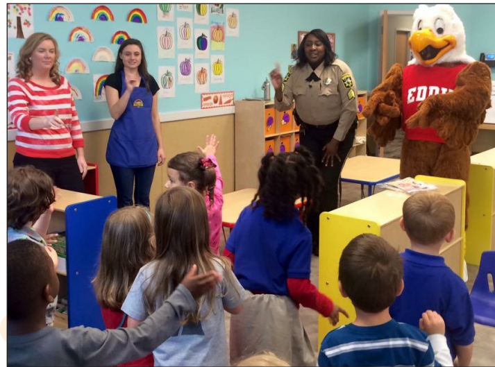
Kids at the Students at the Children's World Learning Center & Academy were very excited to actually meet Eddie at the end of the program with the Pitt County Sheriff's Office in Greenville, NC.

The Eddie Eagle GunSafe program is very proud to have the opportunity to work with hundreds of law enforcement agencies around the country. Every year the program hears great stories of Eddie's success and the tremendous impact that Eddie Eagle has on local communities. Many law enforcement agencies across the country deploy Eddie Eagle at various community events including National Night Out events this August and October