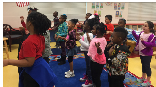
Students at Center Point Elementary School in Center Point, AL learn Eddie Eagle’s GunSafe message: Stop! Don’t Touch. Run Away. Tell a Grown-Up.